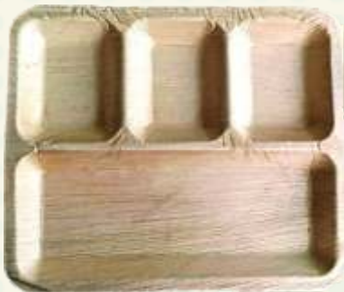
RPT01-12x10" Plate (30x25 cm)