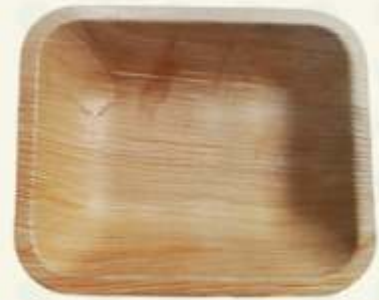
RE02-5"X6 Plate (13x15cm)