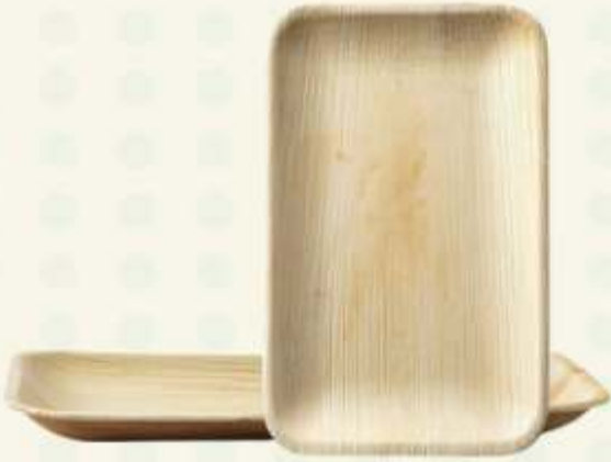
RE01-9"x6" Plate (23x16cm)