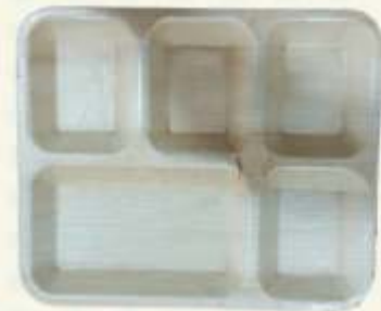
RPT02-12x10" Plate (30x25 cm)